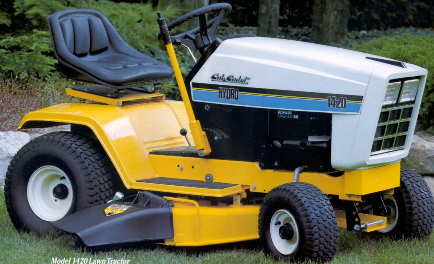
Model 1420 Lawn Tractor 14 HP / Hydrostatic Transmission / Optional 38" Cutting Deck