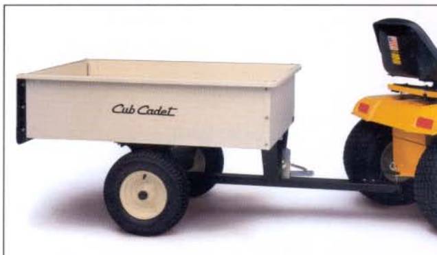
190653 10 Cu. Ft. Trailer