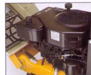
The 12.5 HP Kohler Command Engine provides rugged power for Models 1315 and 1320 Lawn Tractors.