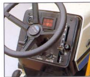
Model 1405 dash features backlit indicators and easy-to-use controls and switches.