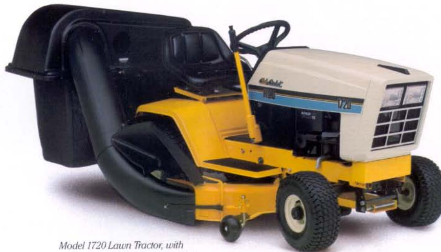
Model 1720 Lawn Tractor, with optional 46" high-vacuum cutting deck and triple bagger.