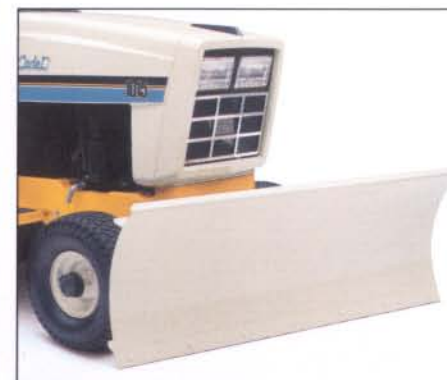
190424 42" Snow Blade