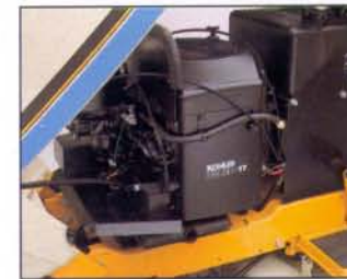
Model 1720 Lawn Tractor is powered by the 17 HP Kohler Magnum engine.