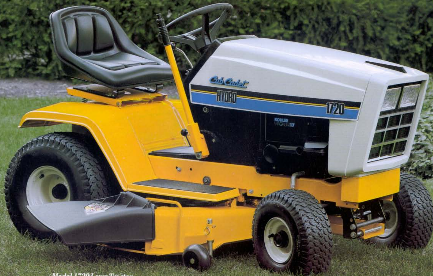
Model 1720 Lawn Tractor 17 HP / Hydrostatic Transmission / Optional 46" Cutting Deck