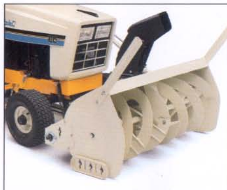
190350 40" Snowthrower (requires Wheel Weights)