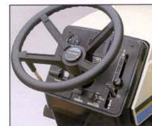
Model 1020 dash is user-friendly, with easy-to-use controls and switches.