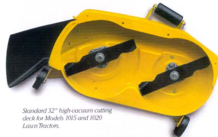
Standard 32" high-vacuum cutting deck for Models 1015 and 1020 Lawn Tractors.