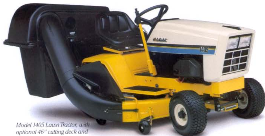
Model 1405 Lawn Tractor, with optional 46" cutting deck and triple bagger.

The Model 1405 is the same as the Model 1420, except it has an over-head valve, single-cylinder Kohler engine, and easy-clutch, easy-shift 5-speed transmission.