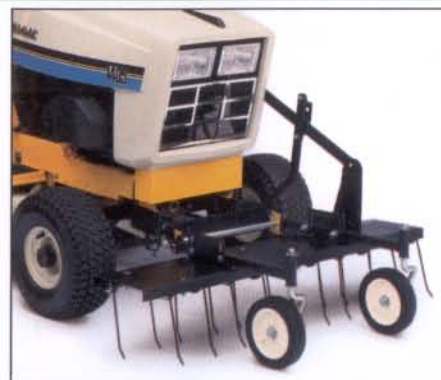
190348 38" Front De-Thatcher