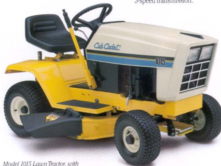
Model 1015 Lawn Tractor, with standard 32" cutting deck.

The Model 1015 is the same as the Model 1020, except it has an easy-clutch, easy-shift, 5-speed transmission.