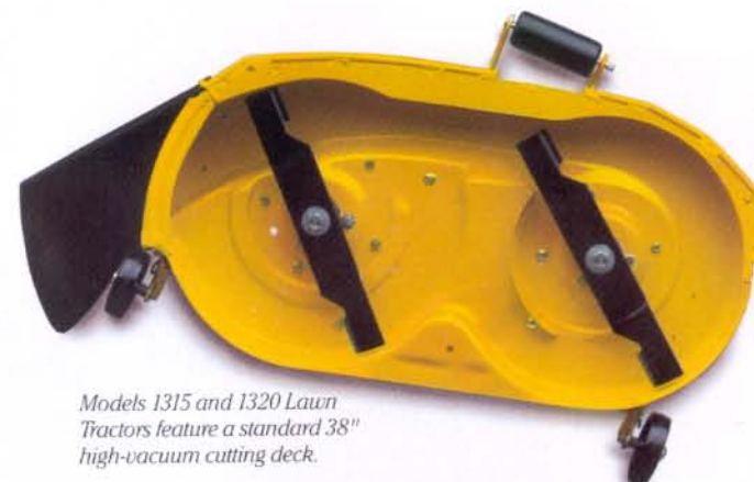
Models 1315 and 1320 Lawn Tractors feature a standard 38" high-vacuum cutting deck.