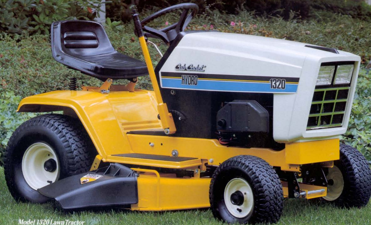
Model 1320 Lawn Tractor 12.5 HP / Hydrostatic Transmission / Standard 38" Cutting Deck