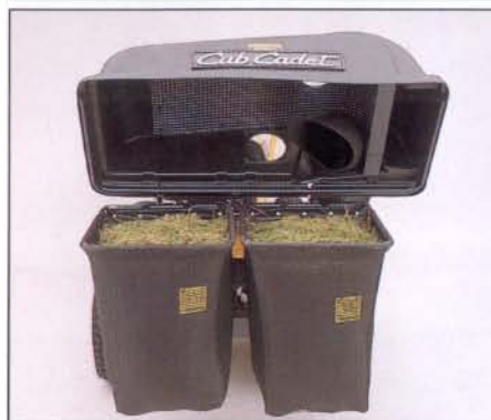
190426 Twin Rear Bagger