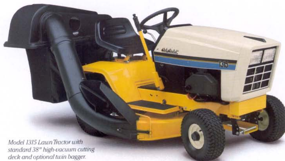
Model 1315 Lawn Tractor with standard 38" high-vacuum cutting deck and optional twin bagger.

The Model 1315 is identical to the 1320, except it has an easy-clutch, easy-shift 5-speed transmission, and 18 x 8.5-8 rear wheels.