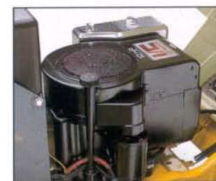
The 10 HP Industrial / Commercial Engine provides plenty of power for Models 1015 and 1020 Lawn Tractors.