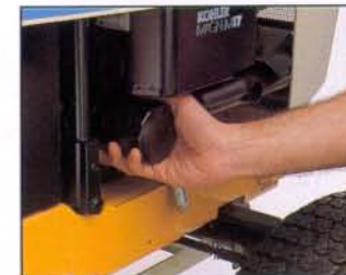
Spin-on oil filter is standard on Model 1720, for easy maintenance.