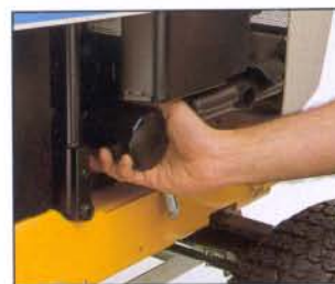
Spin-on oil filter is standard on Models 1420 and 1405, for easy maintenance.