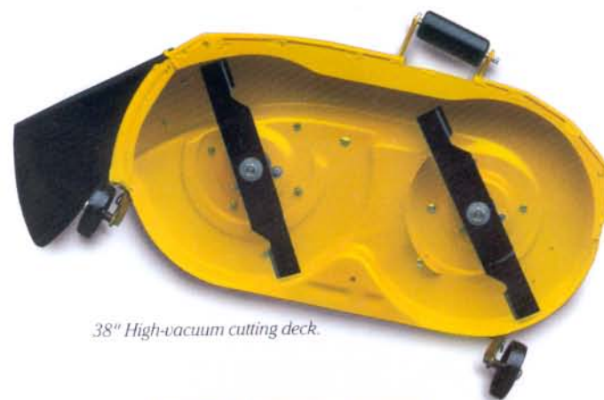
38" High-vacuum cutting deck.