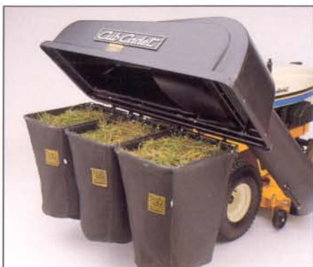
190445 Triple Rear Bagger