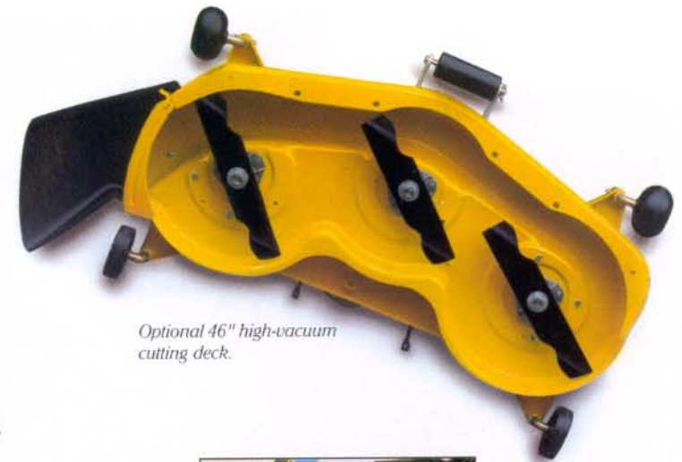
Optional 46" high-vacuum cutting deck.