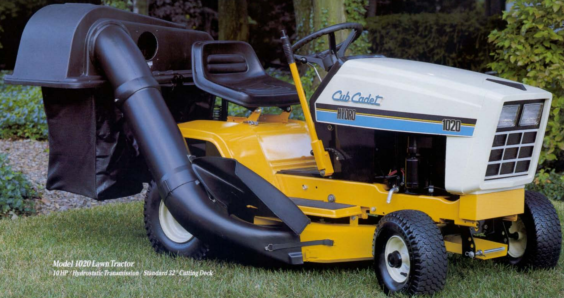
Model 1020 Lawn Tractor 10HP / Hydrostatic Transmission / Standard 32" Cutting Deck