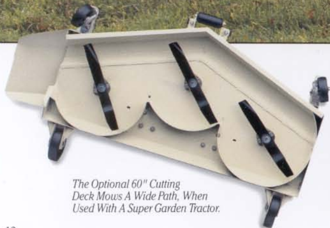
The Optional 60" Cutting Deck Mows A Wide Path, When Used With A Super Garden Tractor.