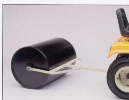
190509 Lawn Roller 36" x 24"