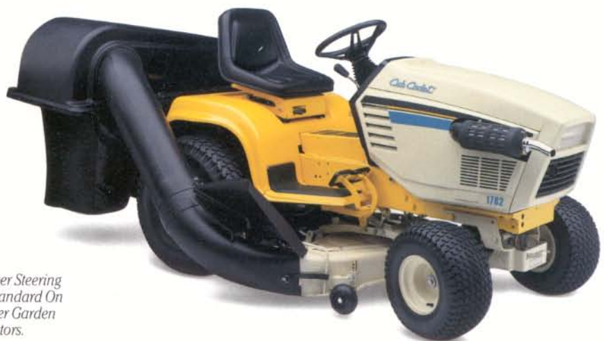
Model 1782 Super Garden Tractor, With Optional 46" High Vacuum Cutting Deck And Triple Bagger. Powered By A 17 H.P. Kubota Diesel Engine.

This tough engine delivers quiet, smooth power while offering exceptional advantages in reliability and economy.