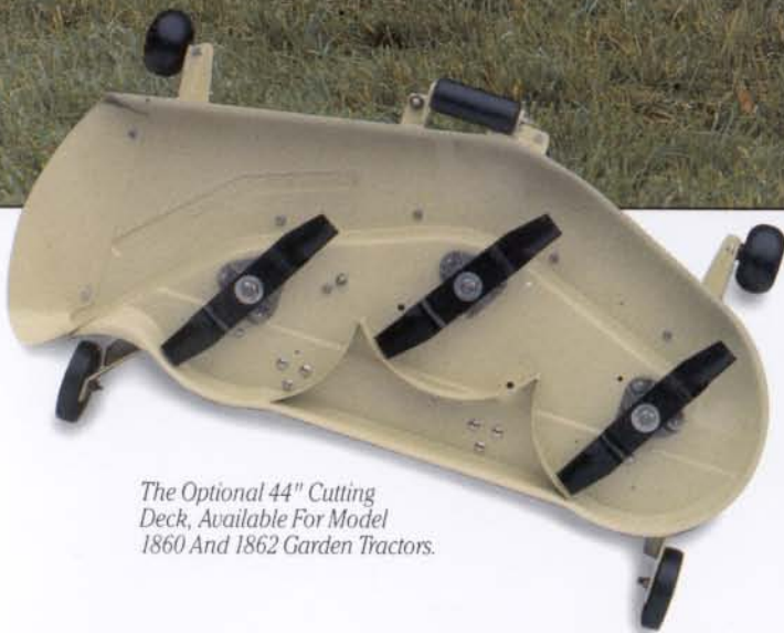
The Optional 44" Cutting Deck, Available For Model 1860 And 1862 Garden Tractors.