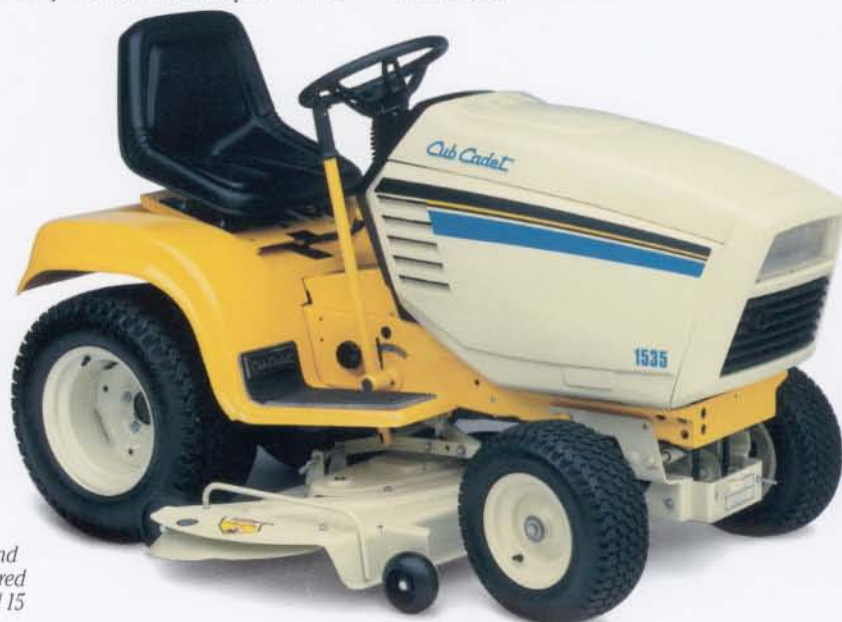
Model 1535 Garden Tractor, With Optional 44" Cutting Deck.

This unit features a 15 H.P. twin-cylinder Kohler Magnum engine, with a 6-speed gear transmission and manual lift.