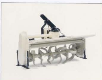
190442 PTO Driven Tiller 40" for Super Garden Tractor