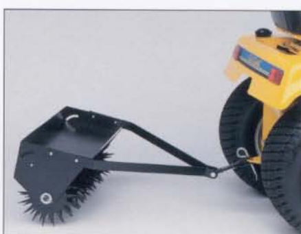
190655 Spike Aerator