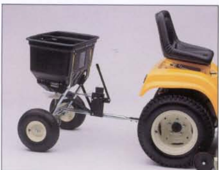
190438 Broadcast Spreader