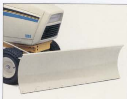
190376 Snow Blade 54"