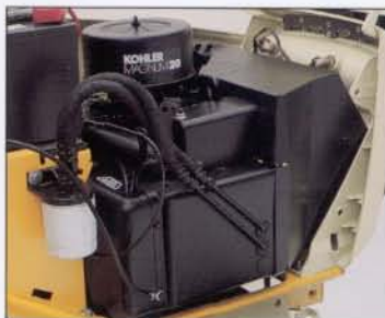
The 20 H.P. Twin-Cylinder Kohler Magnum Engine Makes The Model 2082 A Real Powerhouse!