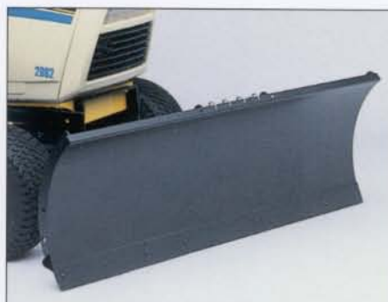
190401 Snow Blade 54" for Super Garden Tractor