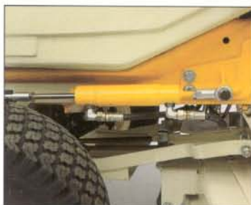
Power Steering Is Standard On Super Garden Tractors.