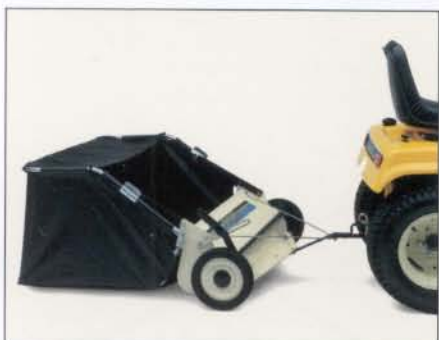
190483 Lawn Sweeper 38"