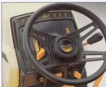
Model 1340 Dash, With Easy-To-Use Speed Control Lever.

38" High-Vacuum Cutting Deck Works With A 10-Bushel Triple Bagger For Maxi- mum Mowing Efficiency.