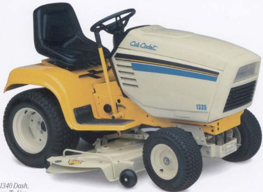
Model 1335 Garden Tractor With Optional 38" Floating Deck

This garden tractor features a 12.5 H.P. overhead valve Kohler engine with 3-speed gear drive transmission. This versatile, direct-drive transmission provides plenty of traction — no matter what loads are encountered — to save valuable time.