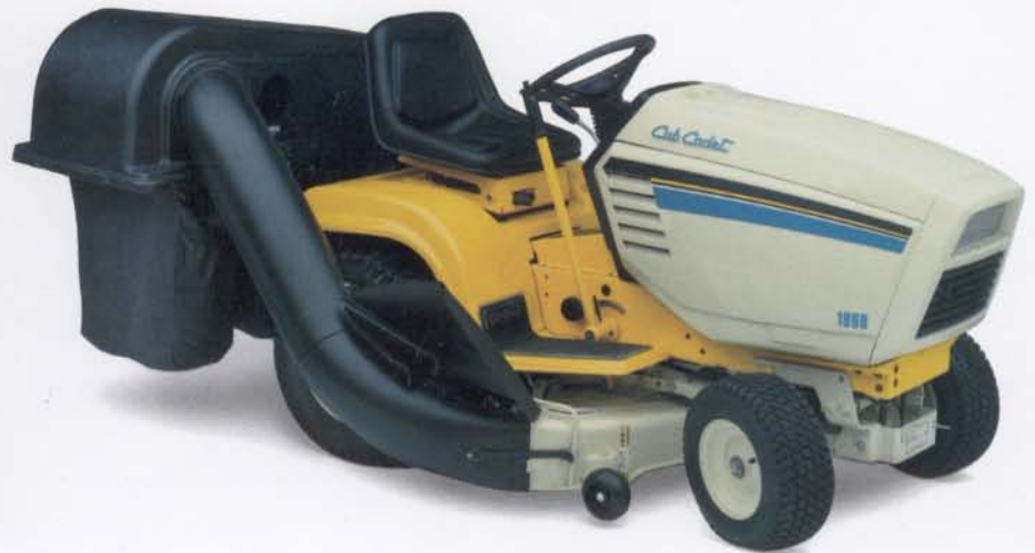
Model 1860 Garden Tractor, With Optional 46" High-Vacuum Cutting Deck And Triple Bagger.

This unit features an 18 H.P., twin-cylinder Kohler Magnum engine. For comfort and convenience it features a hydrostatic transmission, tilt steering, automotive-style steering wheel, adjustable seat, manual lift and optional mowing decks. It does not feature power steering.