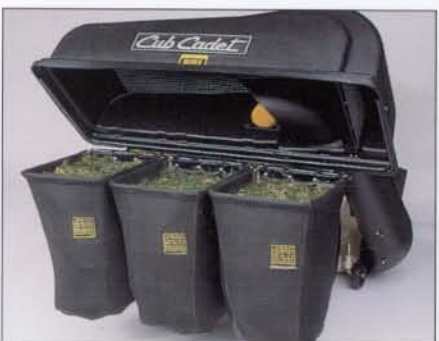
190335 Triple Rear Bagger for 38" and 46" High-Vacuum Decks