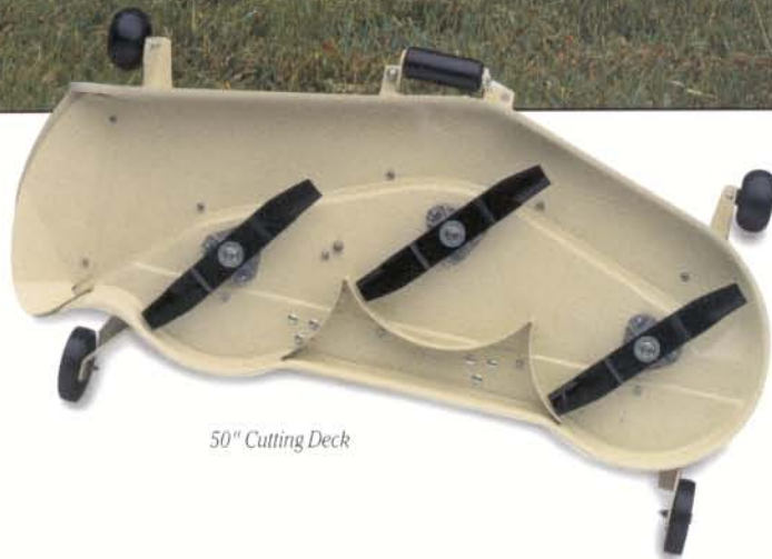
50" Cutting Deck

Super Garden Tractors Are Available With Optional 46", 50", Or 60" Cutting Decks.