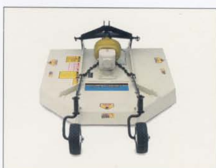
190349 PTO Rotary Cutter 42" for Super Garden Tractor