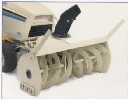
190450 Snowthrower 45", 2-stage