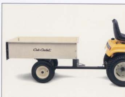
190653 10 Cu. Ft. Trailer (750 lb. capacity)