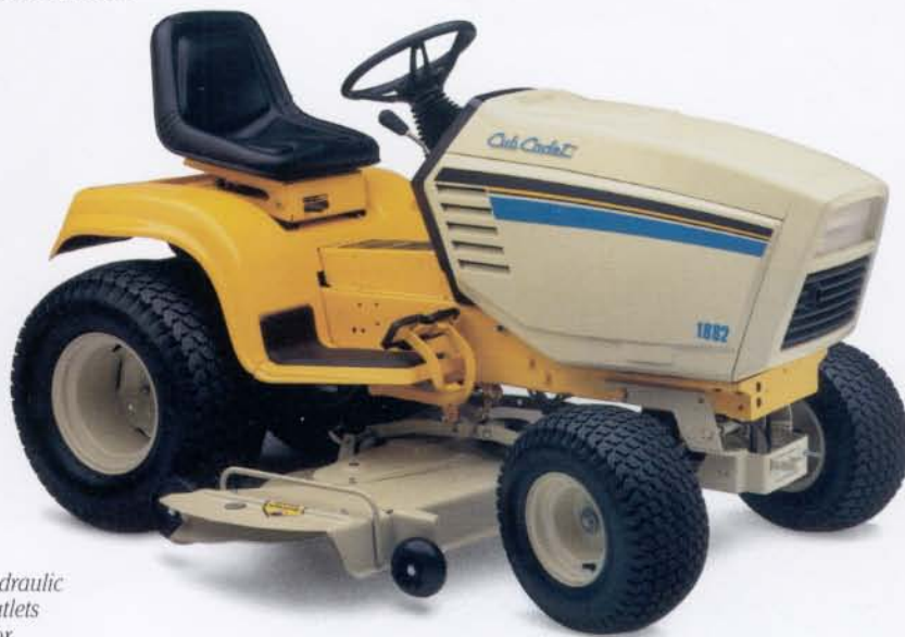
Model 1882 Super Garden Tractor, With Optional 50" Cutting Deck. Powered By An 18 H.P. Twin-Cylinder Kohler Magnum Engine.

The same quality features as the Model 2082 — with an 18 H.P. twin-cylinder Kohler Magnum engine. This engine is designed for optimum performance, even when faced with sudden or intermittent loads.