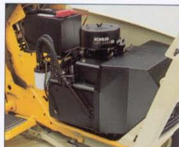
Models 1862 And 1860 Are Powered By The Rugged, 18 H.P. Twin-Cylinder Kohler Magnum Engine.