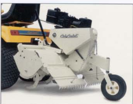
190400 8 H.P. Tiller