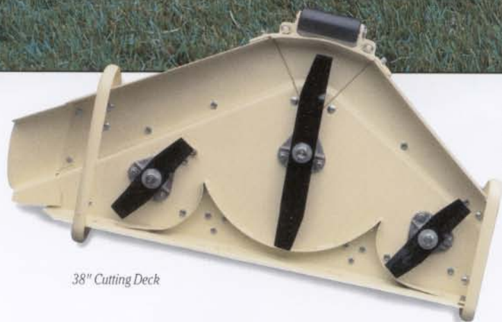
38" Cutting Deck

Garden Tractors Are Available With Optional 38", 44", 46" or 50" Cutting Decks.