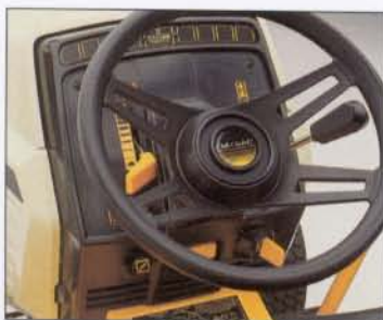
The All New Dash On Model 1860 Garden Tractor Provides Useful Information And Features Easy-To-Use Controls.