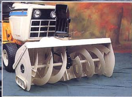
Optional, 40" two-stage Snowthrower cuts through drifts and snow.