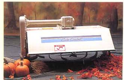
Built rugged for heavy tilling, the optional 40" Bush Hog Tiller features 29 tines for complete tilling and mulching. Available for Models 1772, 1872 and 2072.

Professional results on large properties or commercial jobs require a professional-quality tractor. Cub Cadet Super Garden Tractors are the tough tractors that get the job done.