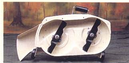
Quick-Attach optional Mowing Decks are available for Model 1050.

truly powerful investment for the first-time tractor owner who has a smaller budget, but big-tractor requirements.