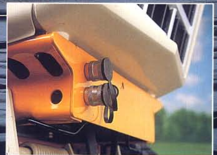
Model 1812 Garden Tractor features dual front hydraulic outlets for angling a Snow Blade.

Model 1872 Super Garden Tractor, and has the same tough features.