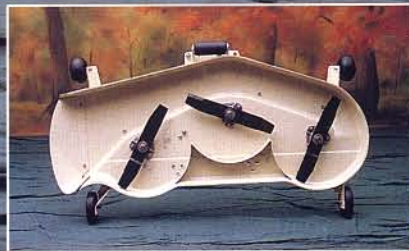
Choose from a 38", 44", 46" or 50" Mowing Deck for your 12 H.P. Cub Cadet Garden Tractor.